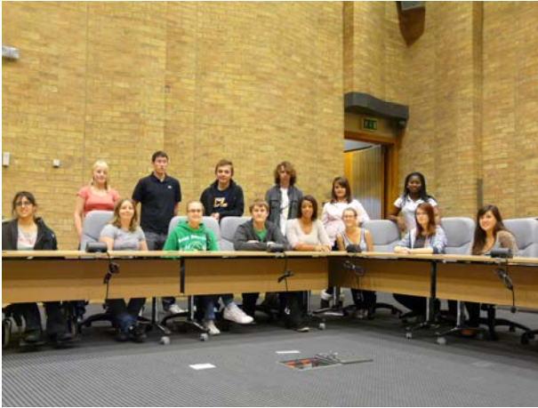
YCAB members at their first meeting in the Civic Chambers

As of September YCAB meetings are held on the first Monday of the month in the Civic Chambers. The Chambers have recently undergone a refurbishment and YCAB were lucky enough to be the first group to hold a meeting in the new space.